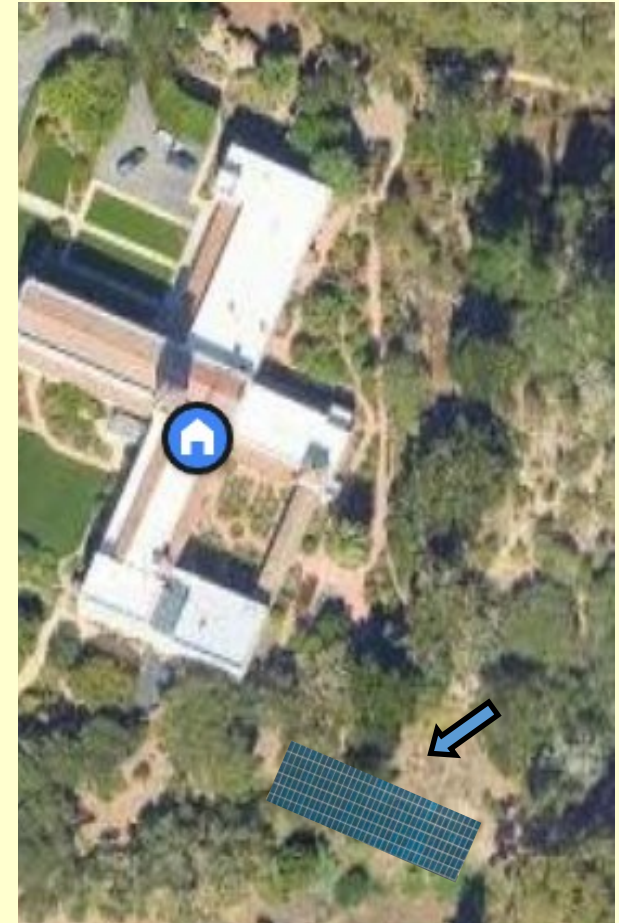
SOUTH ravine pasture