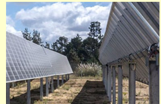
144 57.6K SOLAR GROUND MOUNT PANELS